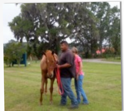
STEADY AS WE GO, MATE!